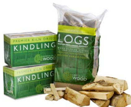
Kindling and firewood packs

carbon neutral fuel. The company has forged close links with a number of wood burning manufacturers and distributors who now recommend Certainly Wood's premier kiln dried firewood and kindling. A retail network of over 250 outlets has now been established throughout the UK and this number continues to rise. One of the main reasons for the success has been the high quality of kiln dried wood, which is essential for wood burning stoves.