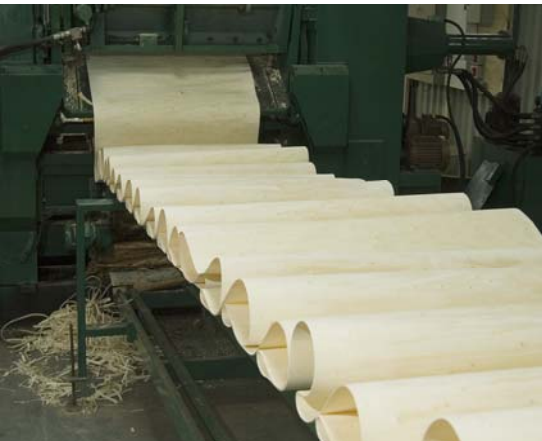
Above:- Testing of the peeling plant

The aim of this newsletter is to update and inform you of work currently being done by