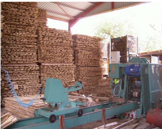
New Polish band saw with boards palletised for drying

All the kindling is produced from poplar thinnings and considerable time and investment has been made in the production of kindling with a new band saw being purchased from Poland which has revolutionised the boarding of round poplar ready for making into kindling. The packing line has also been improved to further reduce costs. The kindling business continues to expand as more and more customers see the benefits of not only a premium product but also a clean and convenient pack unique in the market place.