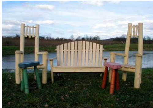
Previous products made

Woodworkers from all over the country are invited to take part in a free competition to construct something creative from a `Kit` of poplar timber.