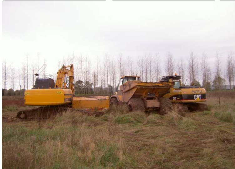
Equipment used for cake application

The Environment Agency visit each site to discuss application rates with ourselves and the contractors. Payment is made on a tonnage basis to the land owner.